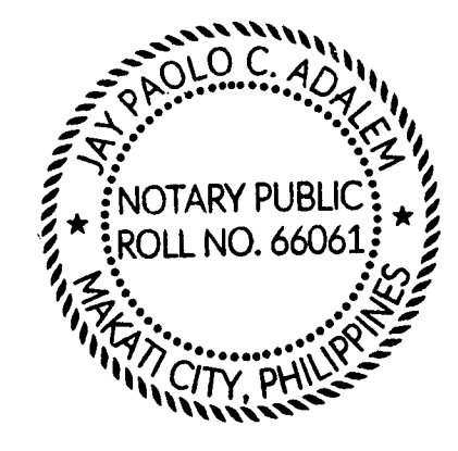
JAY PAOLO C. ADALEM Notary Public for Makati City Appointment No. M-313 Until 31 December 2018 5/F SGV II Building, 6758 Ayala Avenue, Makati City Roll of Attorneys No. 66061 PTR No. 6628746 / Makati / 11 January 2018 IBP No. 026136 / Caloocan Malabon Navotas / 11 January 2018

Doc. No. <u>[8]</u>: Page No. <u>38</u>: Book No. <u>1</u>: Series of 2018.